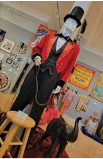
Exhibit open through July 26

Visit the 2022 International Arts Experience exhibit focused on the history of the circuses and the participants affiliated with Decatur, Bloomington-Normal, and Petersburg, Illinois, as well as the cultural influence of circus arts.